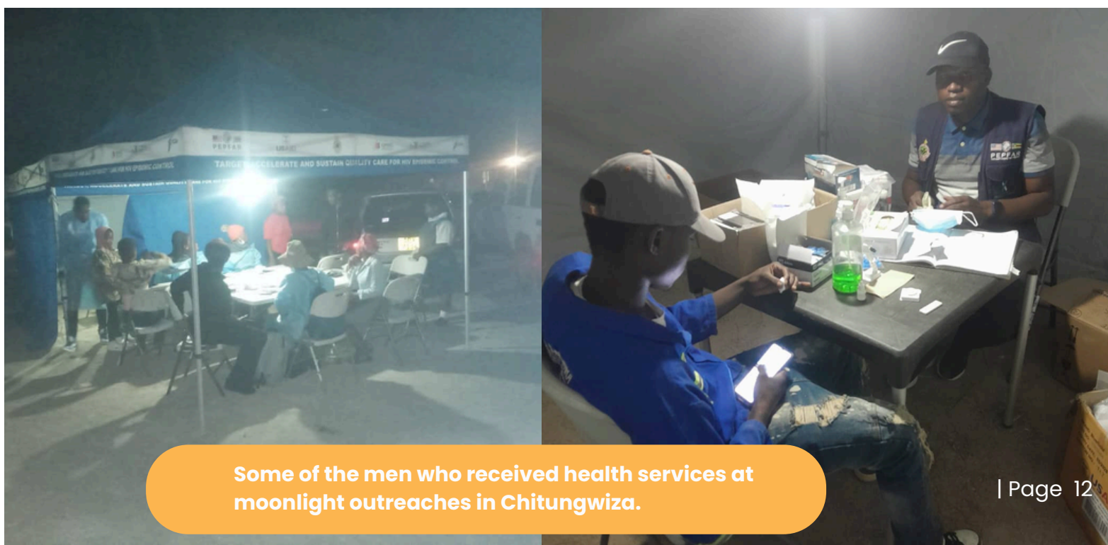
Some of the men who received health services at moonlight outreaches in Chitungwiza.

OPHID, through the TASQC program is prioritizing strategies to engage and support men and boys to prevent HIV and TB. Through initiatives such as moonlight outreaches, OPHID aims to engage men who may not be able to access services during the day due to work or other commitments. This approach leverages the quiet hours of the night to provide discreet screening for HIV, TB, Diabetes and Hypertension. At the outreaches, services such as PrEP and ART initiation, distribution of condoms and HIV self-test kits, and provision of health education are available. In June, Chitungwiza District reached 384 men and 114 females with health services at moonlight sites alone. The initiative represents a significant step towards inclusive healthcare delivery.