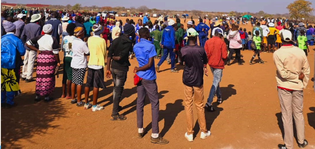
Members of the public attending various community health outreaches in Bulawayo .

In Quarter 3, OPHID made strides in connecting healthcare facilities with communities through integrated community health outreaches. These outreaches brought essential healthcare services directly to the people in need. A key focus of these outreaches was to provide health education and promote preventive measures within the community. The success of these outreaches highlights the importance of community-based healthcare initiatives in improving access to quality services. Looking ahead, OPHID remains committed to sustaining this approach to create a healthcare system that is responsive to the diverse needs of the populations it serves.