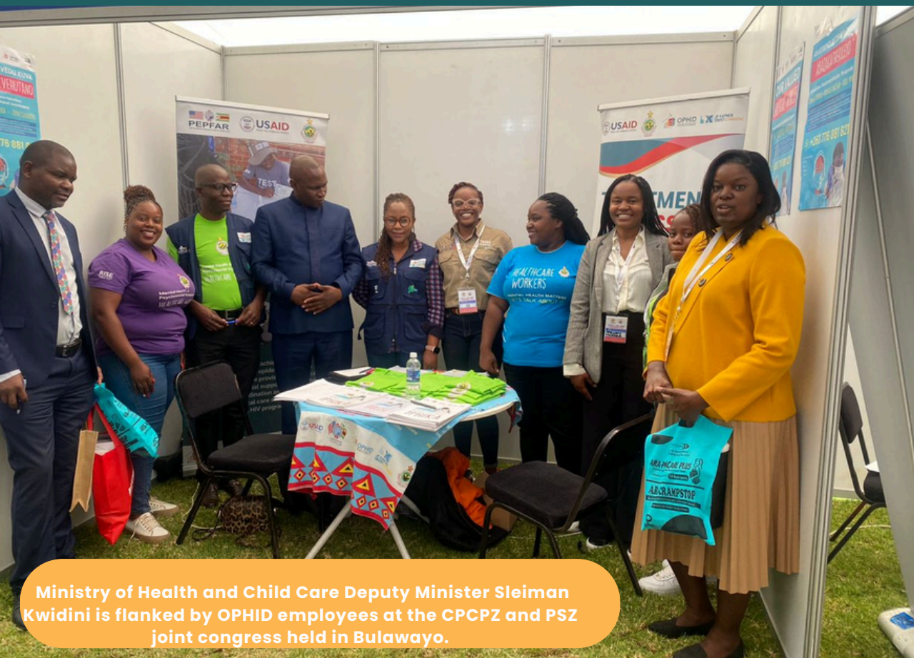
Ministry of Health and Child Care Deputy Minister Sleiman Kwidini is flanked by OPHID employees at the CPCPZ and PSZ joint congress held in Bulawayo.

OPHID supported the joint congress for the College of Primary Healthcare Physicians of Zimbabwe (CPCPZ) and the Pharmaceutical Society of Zimbabwe (PSZ) in Bulawayo. Honourable Sleiman Timios Kwidini, Deputy Minister of Health and Child Care, visited the OPHID stand and appreciated the great work that OPHID is doing to complement MoHCC work.