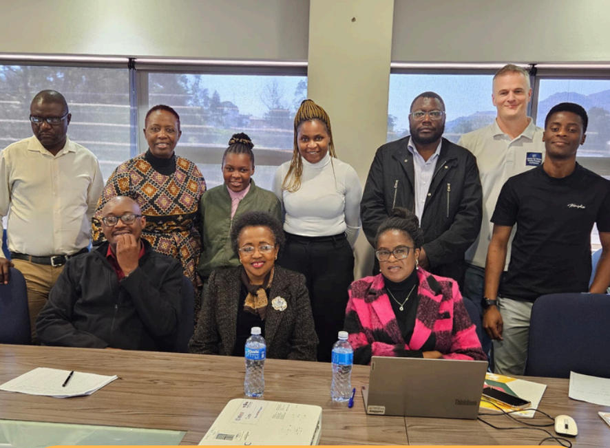
Delegates from Zimbabwe and Eswatini during the Paediatric HIV look and learn visit in Eswatini.

OPHID participated in a Paediatric HIV look and learn visit in Eswatini together with the Ministry of Health and Child Care and Zimbabwe Health Interventions from 19-21 June 2024. The goal was to strengthen national strategies to improve the quality of care and support services for children living with HIV in Zimbabwe. The visit also sought to facilitate knowledge exchange, enhance technical skills, improve prevention strategies, and promote the sharing of best practices in managing paediatric HIV towards epidemic control for children. The visit established a collaborative and supportive relationship between healthcare professionals specialized in paediatric HIV prevention, care, and treatment in Zimbabwe and eSwatini