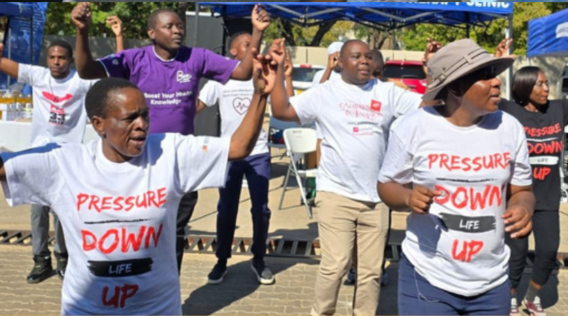
OPHID Bulawayo employees undergo physical exercises during the Wellness Day commemoration.