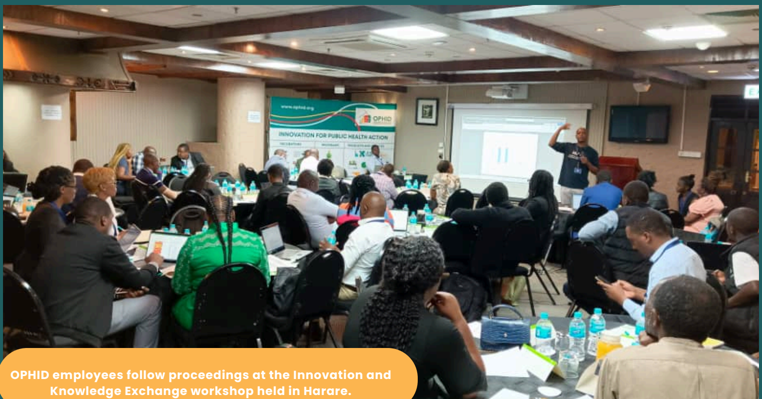
OPHID employees follow proceedings at the Innovation and Knowledge Exchange workshop held in Harare.

To cascade on local knowledge-based practice, OPHID conceptualized and initiated the Ilima/Jakwara: Health and Development Knowledge Exchange fora. The practice promotes knowledge sharing, peer learning, and emphasizes practical application of skills.