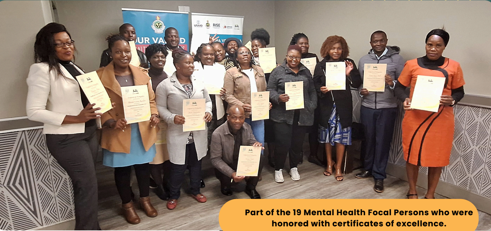
Part of the 19 Mental Health Focal Persons who were honored with certificates of excellence.