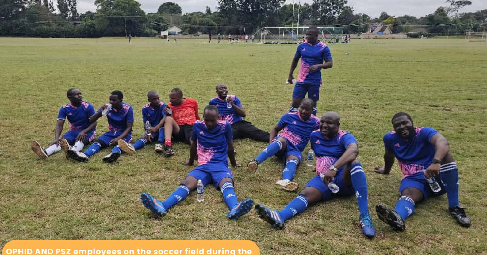
OPHID AND PSZ employees on the soccer field during the friendly match in Harare.