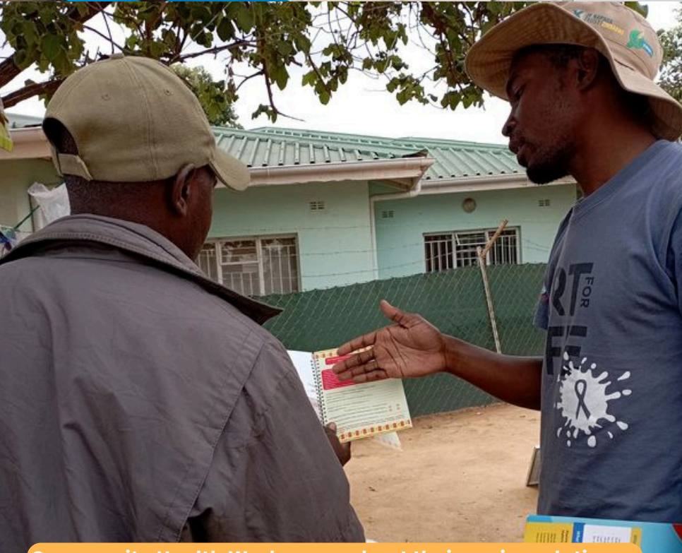
Community Health Workers go about their various duties.